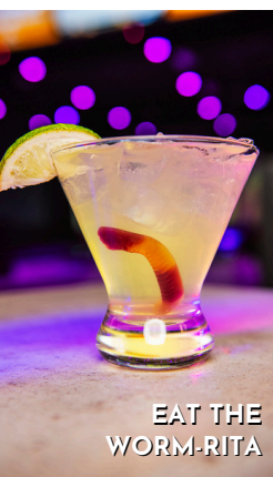
EAT THE WORM-RITA