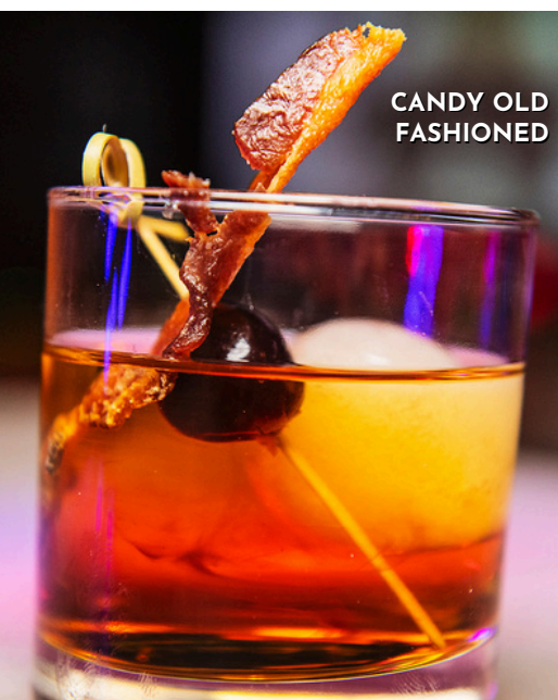
CANDY OLD FASHIONED