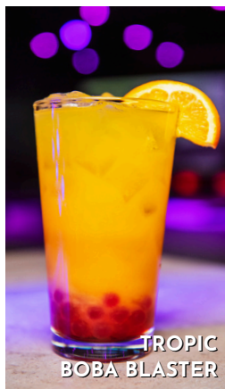
TROPIC BOBA BLASTER