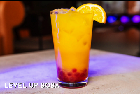
LEVEL UP BOBA

Sparkling Italian soda infused with sweet strawberry or tropical passion fruit. A fizzy, creamy, fruity, treat in every bubbly sip!