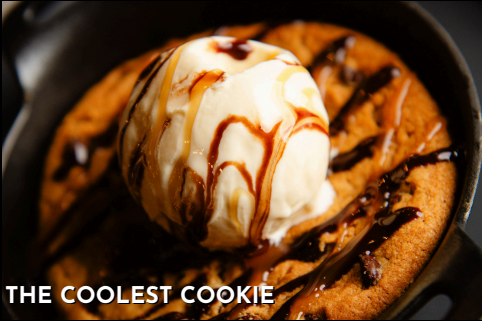
THE COOLEST COOKIE